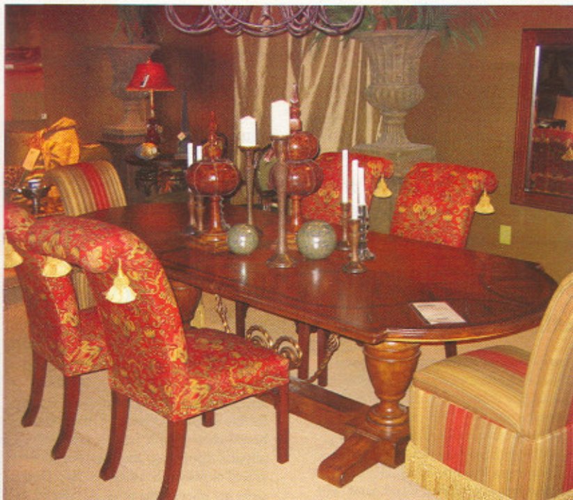
European Home likes to mix and match striking upholstered chairs around a table to add drama to the dining experience.

Consumers who plan to use their table to aid in rising from chairs should avoid single pedestals. Those who want little to no flex in their table should not use pedestals. Leg tables provide the most stability, because their centers of gravity are at the four corners. Leg tables usually provide more size and style options than pedestal tables, as well.