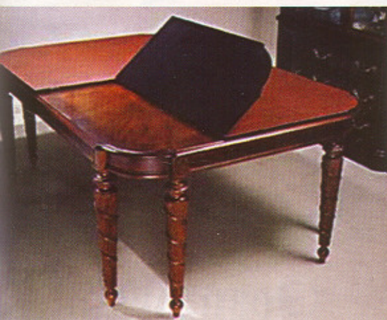
Elite Table Pads from Century Table Pads offer half an inch of protection as well as 550 degrees Fahrenheit of protection at the table surface against accidental heat sources.