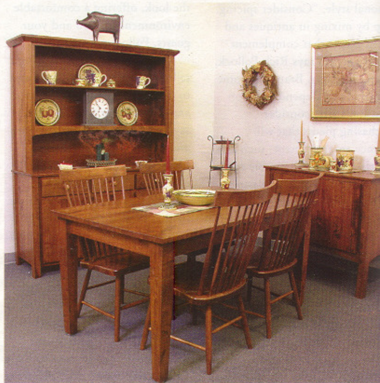
A dining set in the country farm style offered by All American Home.

With the center of gravity in the middle of the table, consumers will find more flex when pushing down on a table's corners, Kull explains. On quality double-pedestal tables, this flex isn't anything to worry about. The table won't break or tip over. However, smaller single-pedestal tables can be prone to tipping if pressed hard enough.