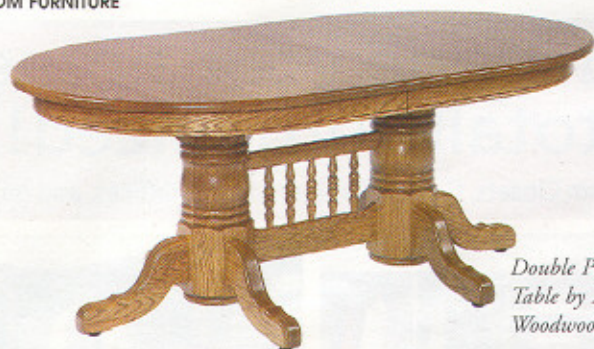
Double Pedestal Table by EH Woodworking