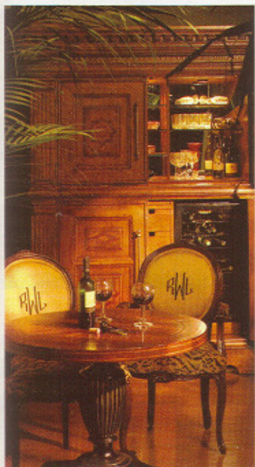
This signature bar armoire from European Home Collection makes a great addition to a dining room in place of a buffet or hutch.

House & Home asked local retailers about their best selling dining room sets. Here's what they told us.