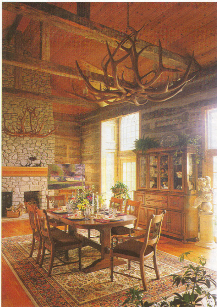
New Look Interiors offers this set, which includes a table with a unique trestle base. The china cabinet has beveled glass with lighting. This traditional design consists of solid cherry.

A dining room should reflect personal style. "Consider spicing it up by mixing in antiques and accent pieces that complement the set's style," says Rich Pollock, general manager, Brandon Home Furnishings. "Depending upon the room's size, consider purchasing pieces that will enhance entertainment, such as a beautiful bar with a marble top and brass rail that invites guests to linger after enjoying a meal.