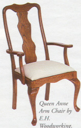
Queen Anne Arm Chair by E.H. Woodworking.

choose furniture that suits your fancy and accommodates your guests