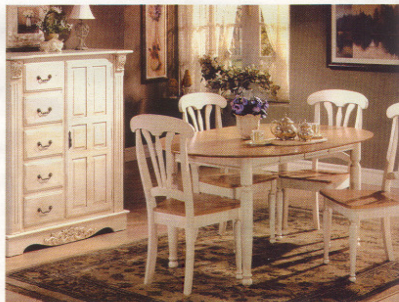
A French country dining set by Enterprise Midi, sold at Creative Dinettes.

670 Deer Road, Cherry Hill, NJ MINUTES FROM 295