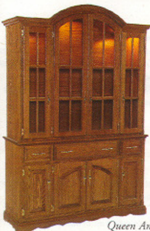
Queen Anne Hutch by E.H. Woodworking.

Allow at least 2 feet minimum for walking space around the table when the chairs are in use and have been pulled away from the table.