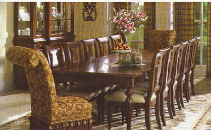
A collection with heirloom qualities, intricate carvings and inlay and extra leaf accommodates seating for 12. Table opens to 122 inches. A Domain exclusive.