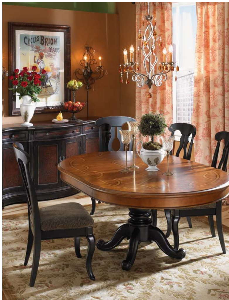
The Wesley dining room from Domain Home Fashions.