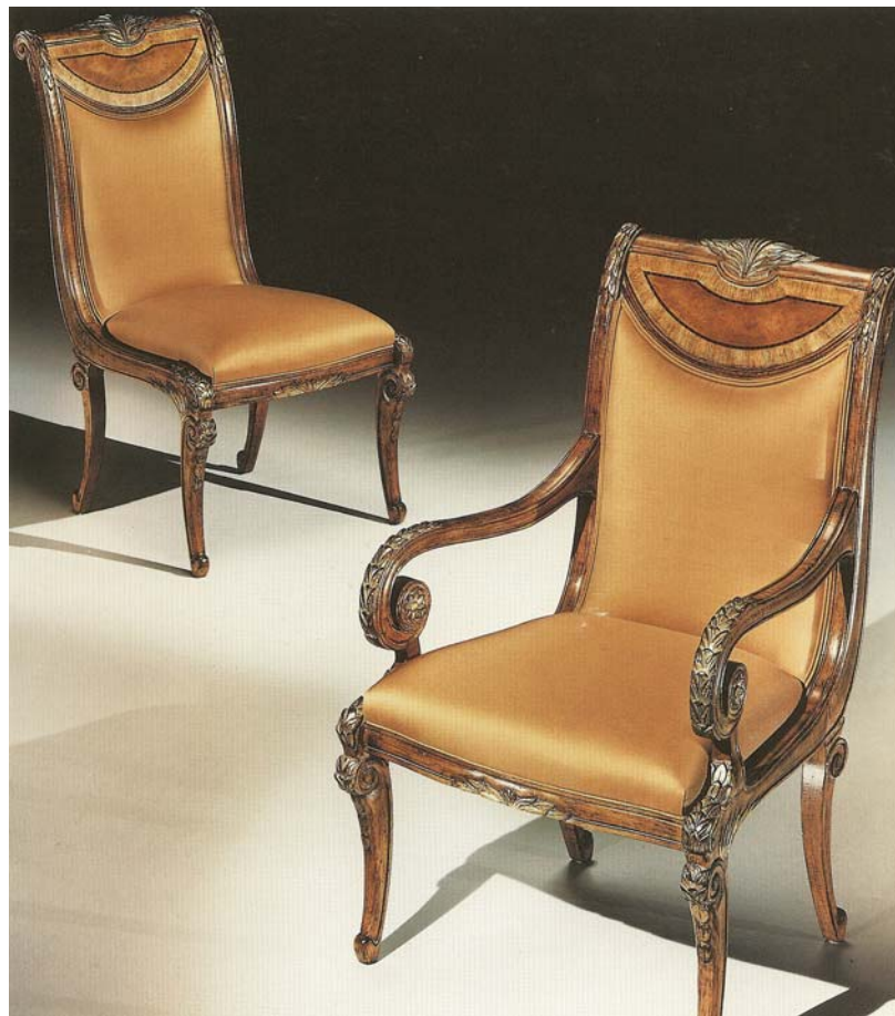
Shown in Provence gold with inlaid marquetry and ash burl finish, this empire side chair and armchair are just two of the many unique choices recommended by Le Montage Interior Design that provide comfort and style to an elegant setting.