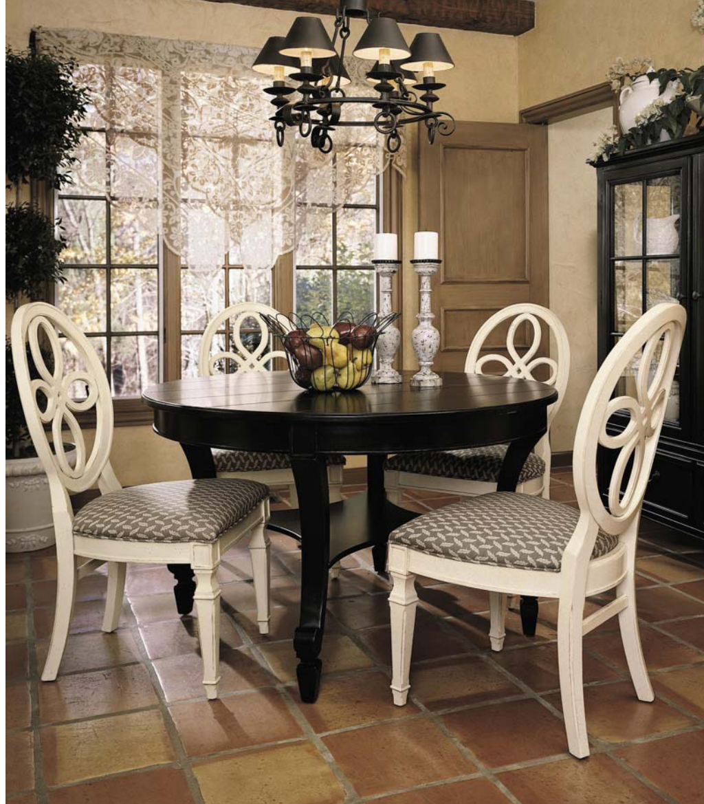
Newport Furnishings sells this dining vignette that features the use of mixed wood finishes.