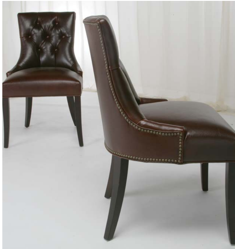
Top: This Nelson leather tufted arm chair also comes in a side chair. Sold at Domain Home Fashions.

The focal point of a dining room is often the table itself or an interest-