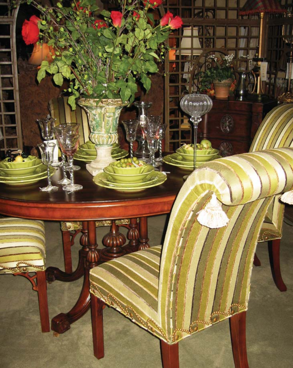
These richly upholstered chairs by designer Raymond Waites complement the small oval dining table at European Home Collection.