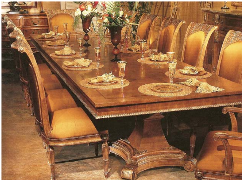
Le Montage Interior Design offers this double pedestal empire dining table in Provence gold with intricately carved inlaid ash burl veneers and four hinged aprons with two center support legs. The table extends to 174 inches with four 20-inch leaves.

Beddia: We always feel comfortable suggesting the addition of painted pieces because they can complement many wood tones and create a special